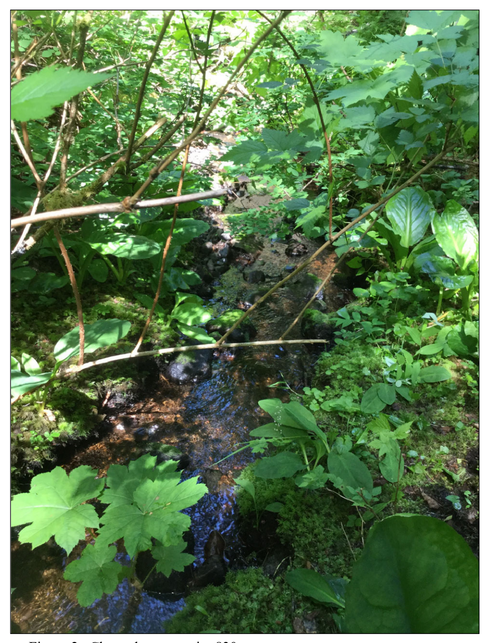
Figure 2.-Channel at waypoint 830.