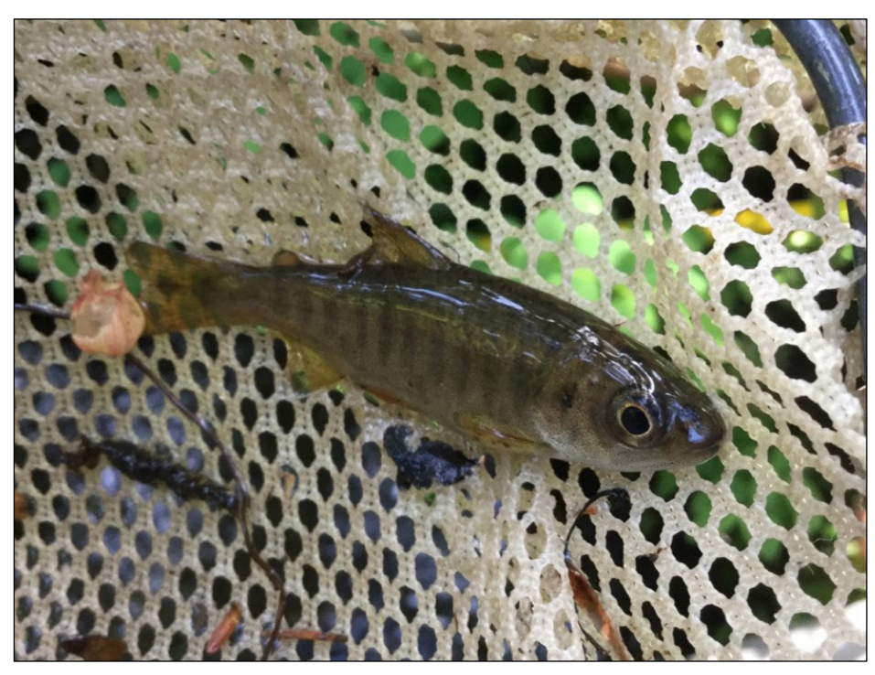
Figure 1.—Juvenile coho salmon captured at waypoint 831.